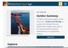
Britannica High School