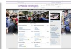
Gale: Opposing Viewpoints