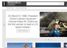
Gale in Context: Middle School